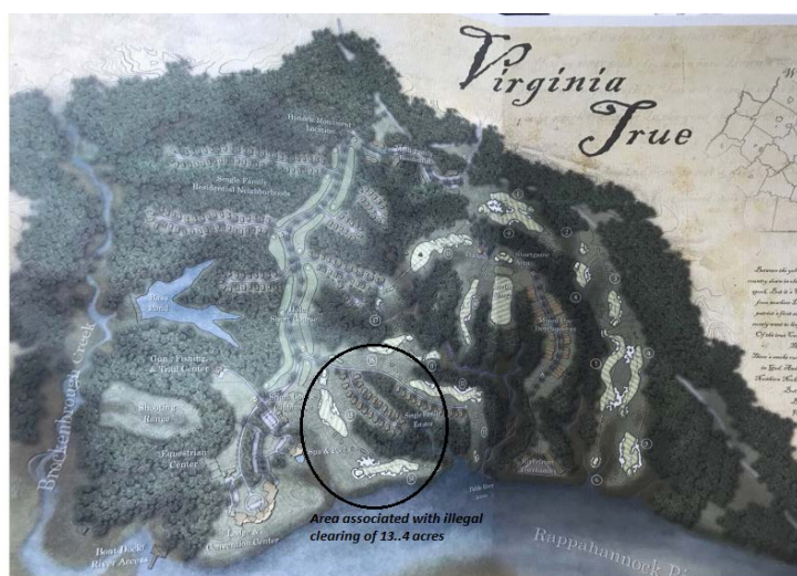
Exhibit 9: Virginia True concept plan (c. 2016) with annotation

indicating area cleared in fall 2017. Note plan envisions a treeless cliff edge for the lodge and several of the golf holes.