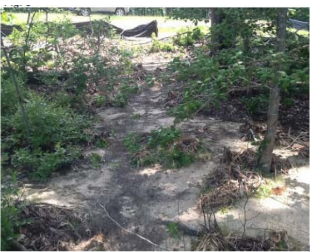
Exhibit 6: Photo (Figure 5) from June 8, 2018 DEQ inspection report

showing sediment escaped from the silt fence and deposited downstream of the property toward the cliff edge and the river.