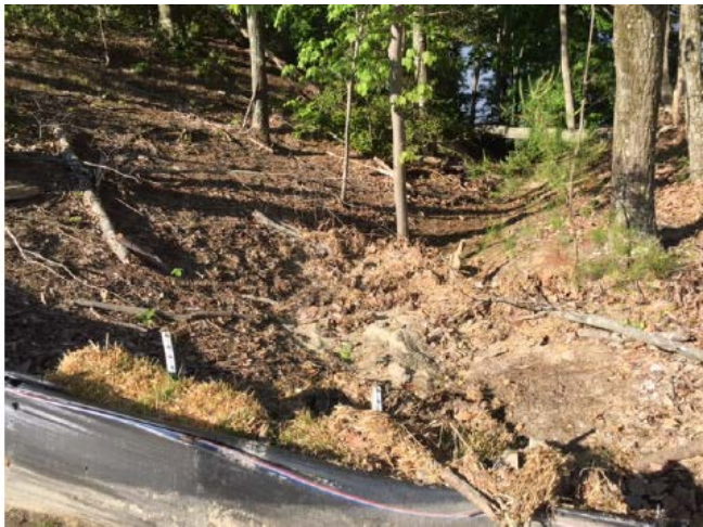
Exhibit 5: Photo (Figure 8) from May 8, 2018 DEQ inspection report

following second landslide at cliff on June 2, 2018. Note additional soil loss at the site and stream of sediment moving from the toe of the cliff into the Rappahannock River.