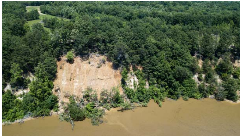
Exhibit 4: Drone footage taken June 4, 2018

following second landslide at cliff on June 2, 2018. Note additional soil loss at the site and stream of sediment moving from the toe of the cliff into the Rappahannock River.