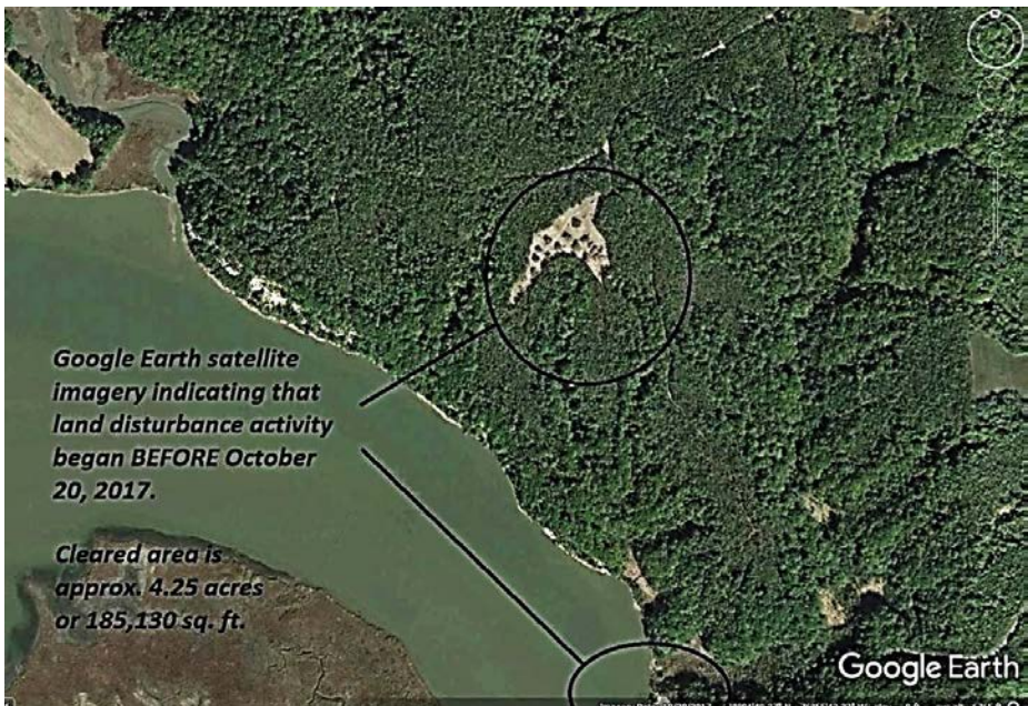
Virginia True property showing 4.25 acres of land illegally cleared before October 20, 2017.

Virginia True Corporation began illegally clearing land at its proposed golf resort on top of Fones Cliffs (Tax Map 4 Parcel 1) during the fall of 2017. Exhibit 1 presents satellite imagery dated October 20, 2017 where 4.25 acres have already been cleared. FOR became aware of activity in mid-November. At that time FOR Tidal River Steward, Richard Moncure, alerted Richmond County officials of land disturbance issue near the edge of Fones Cliffs.