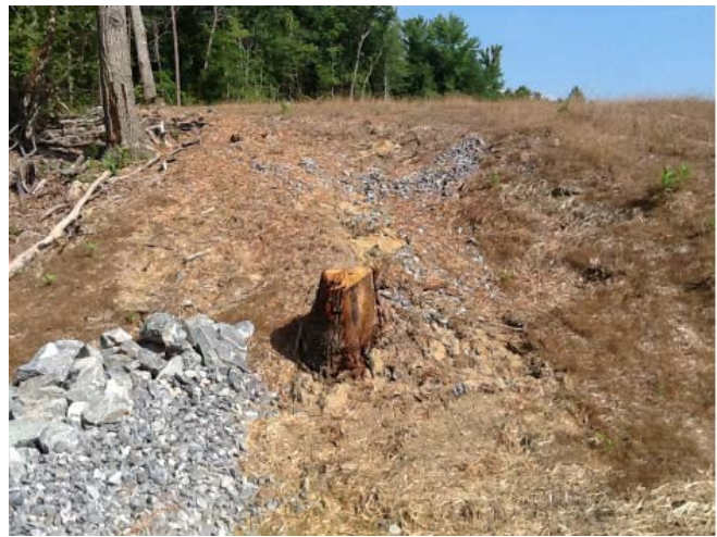
Exhibit 7: Photo (Figure 6) of the July 13, 2018 DEQ inspection report of Virginia True property. Note the inadequate soil stabilization on a steep slope at edge of cleared area (more than 7 months after the Stop Work Order issued by Richmond County.)