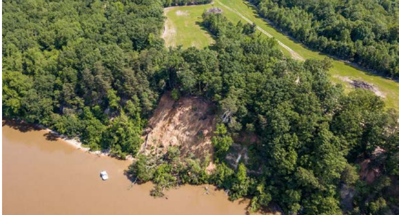
Exhibit 3: Drone footage of Virginia True Property taken on

More problematic is the fact that subsequent DEQ inspections in May, June and July have continued to indicate incomplete site stabilization, failure to maintain stormwater best management practices (BMPs), and non-compliant record keeping. Also on May 21 and June 2 two large slides occurred on Fones Cliffs directly adjacent to the 13.4 acres of cleared land. Exhibits 3 and 4 show drone footage of the cliffs following these events. Exhibits 5, 6 and 7 show photographs from DEQ inspection reports from May 8, June 8, and July 13 that show evidence of runoff leaving the cleared area on Virginia True's property and flowing over the cliff edge and continued failure to adequately stabilize the site.